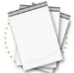
Plastic shipping envelopes