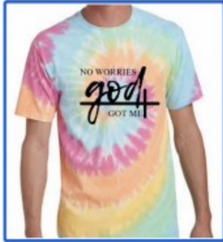
A - No Worries, God Got Me

We will be offering a GROOVY t-shirt sale!