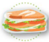
Ziploc & other reclosable food storage bags