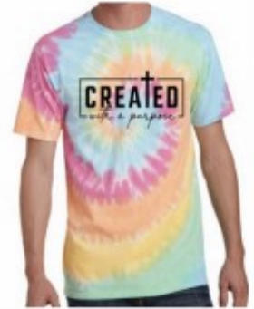
D - Created with a Purpose