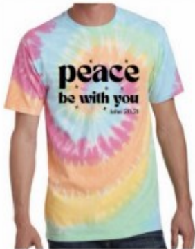
E - peace be with you (starburst)