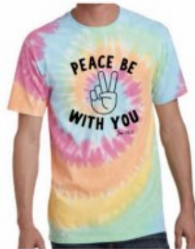
F - Peace Be With You (peace sign)