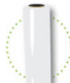
Pallet wrap & stretch film