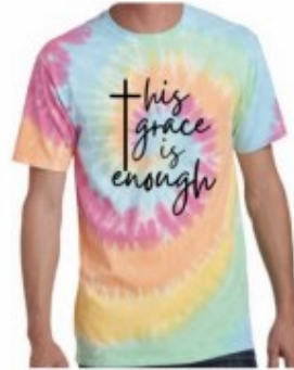
C - his grace is enough