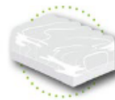
Wood pellet bags