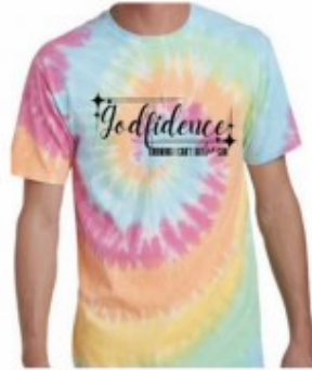
B - Godfidence Knowing I Can't, But He Can