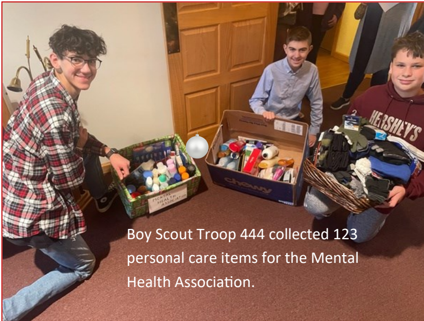
Boy Scout Troop 444 collected 123 personal care items for the Mental Health Association.

The Christmas Poinsettia order must be called in by the 7th of December. If you missed placing your order, you may call the church office by December 6th and leave your order over the phone.