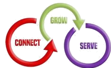
"Membership Has It's Privileges"