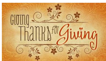
Plate Offering: $2785.75